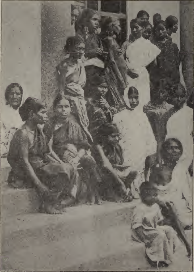
WAITING FOR THE DOCTOR, MADURA